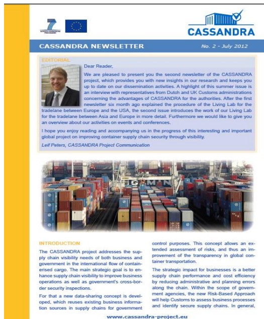
Figure 3: Newsletter No. 2