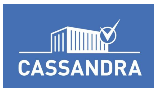
Figure 1-1 CASSANDRA logos; color